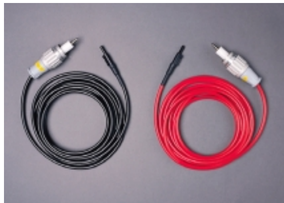
Cable set GA-00090