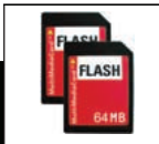
64/128 MB MMC