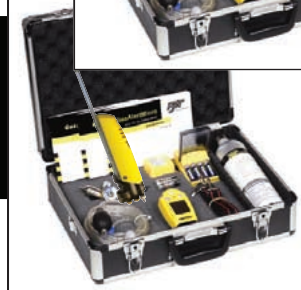
Confined Space Kits with Sampler