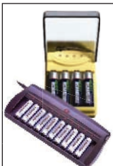
VAC and VDC Vehicle Kits