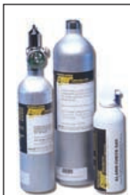
Quad Gas Kits Cylinders Bump Test Gas