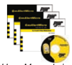
User Manuals in local languages