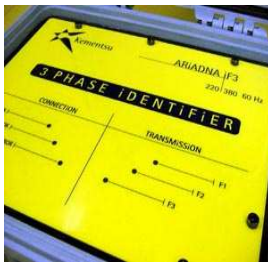
Central Unit (UC)

Low voltage connectivity data (relates data from MV/LV transformer and phases with end user) results critical for the correct management of electrical distribution network. The use of this data in a GIS solution allows calculation of transformer load balances, faults, preventive maintenance tasks planning, etc., and at end, to guarantee the quality of the electrical supply.