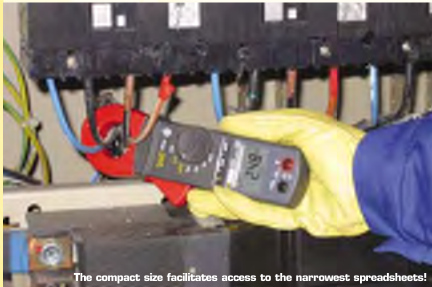
The compact size facilitates access to the narrowest spreadsheets!

For professionals of testing and maintenance in the industrial and tertiary sectors faced with this challenge, F62-F65 pocket-sized clamps are the recognised solution. While providing the full range of functions proposed by conventional multimeter clamps.