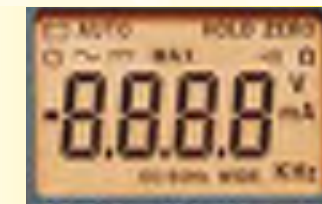
Backlit 10 000 counts LCD screen

Activation of anti-harmonics filter (Hold key)