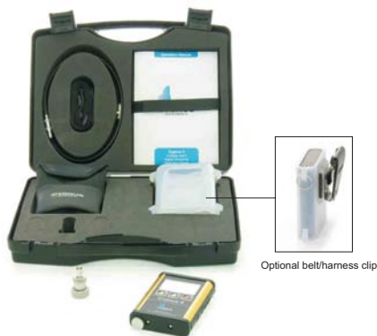
Optional belt/harness clip

Instrument, 2.25 MHz x 13 mm diameter probe, spare membranes, 15 mm steel test block, membrane couplant, ultrasonic couplant, accessory pouch, protective silicone sleeve with neck strap, operation manual, carry case and optional belt/harness clip.