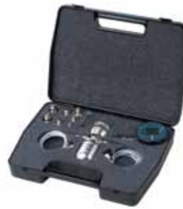
Low pressure pneumatic test kit

Includes: DPI 104; ranges to 30 psi (2 bar), PV 210 low pressure pneumatic test pump, hose, adaptors, seal kit and case.