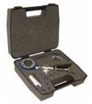
Pneumatic test kit