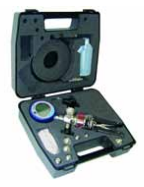
Hydraulic test kit