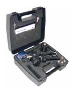
Pneumatic and hydraulic test kit