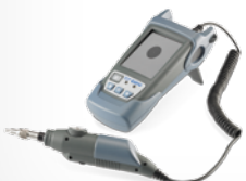
Fiber Inspector Probe FIP-400