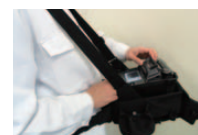
⑥-1 Working Belt in Action