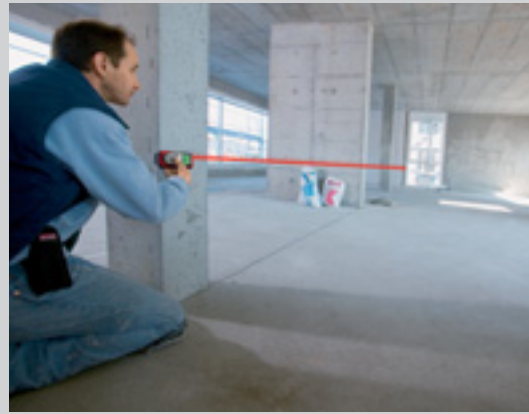
Room calculations: Pushbutton access to readings for room dimensions, wall and ceiling areas.