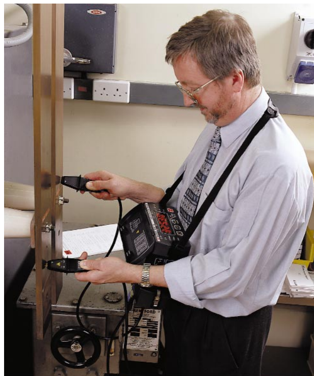
The DLROs are light enough to be worn around the neck. They are also small enough to be taken into areas which were previously too cramped for easy testing.