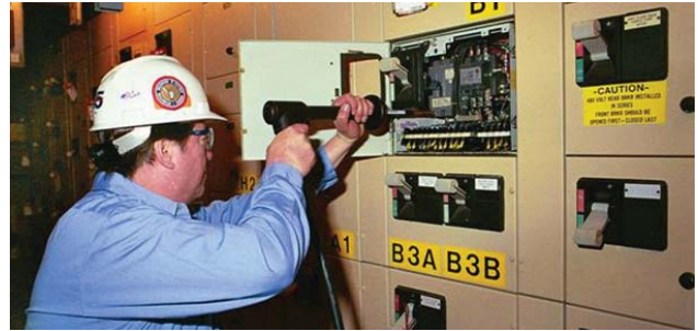
MCCB testing using the HCP2000