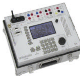
DVS3 Digital voltage source