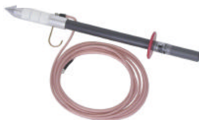
DP20 Discharge probe