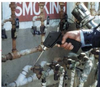
Tests steam traps