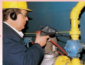
Ultraprobe 100 testing pump valve leaks

The Ultraprobe® 100 is a practical tool for any leak detection, steam trap inspection or mechanical troubleshooting program. Simple to use — find compressed air and steam leaks and prevent machinery failure with this unique instrument.