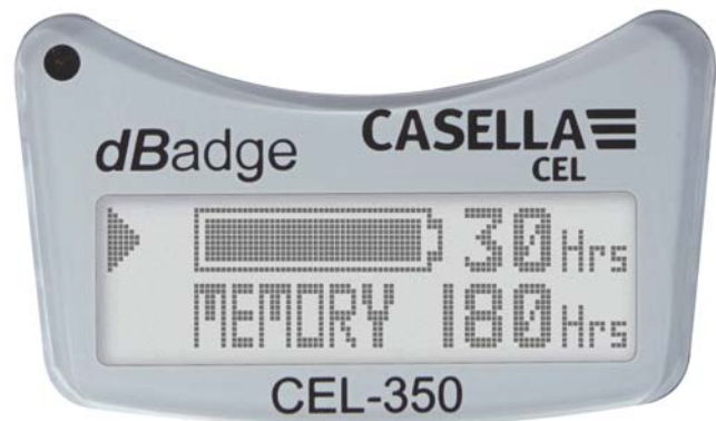
'Fuel gauge' display for memory and battery information

In addition to noise exposure parameters, the time history of the noise is logged in 1 minute values of both the average noise level and the peak value for subsequent analysis of how the noise exposure has occurred. This data can be viewed and analysed via dB35 software.