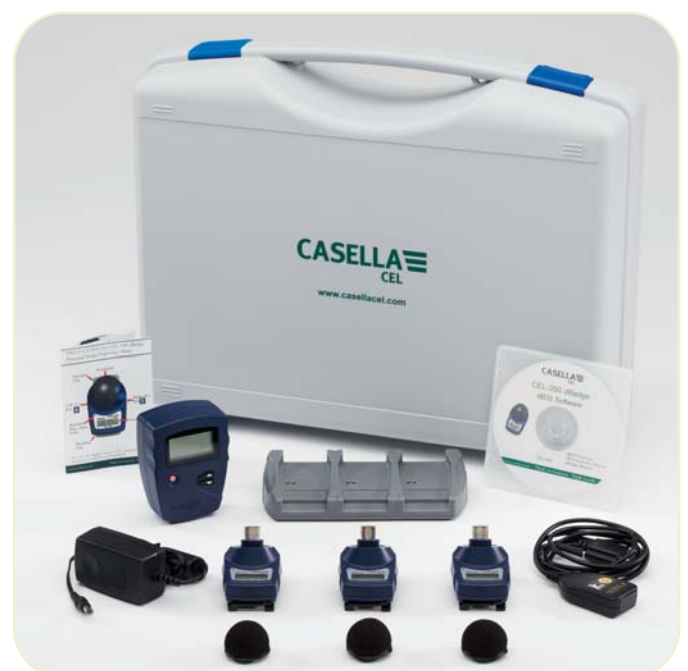
A typical measurement kit

dBadge measurement kits are available with various quantities of dBadges and include all items necessary for workplace noise dosimetry measurements. Each kit is complete with the appropriate number of dBadge units, as well as a CEL-110/2 Acoustic Calibrator, infra-red download cable, 3-way charger, power supply and dB35 software. The CEL-350 dBadges and the CEL-110/2 Acoustic Calibrator are supplied with calibration certificates.