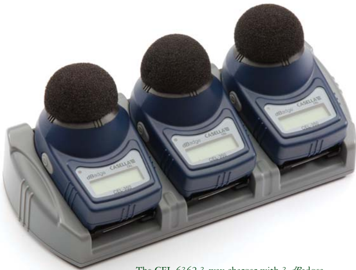
The CEL-6362 3-way charger with 3 dBadges