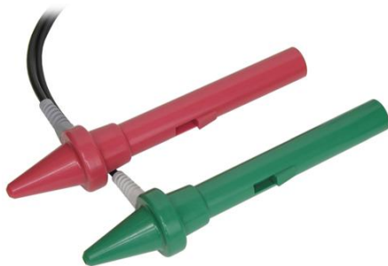
High voltage output probes

Other voltages and ratings for this unit are available as special products on request. The picture overleaf shows a KV4-300, a unit with a 4kV, 300mA rating. Units have also been supplied with a 3kV 250mA rating. If you would like a quote for your specialist requirements, please contact us.