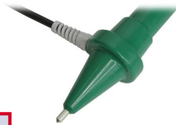
Output probe tip