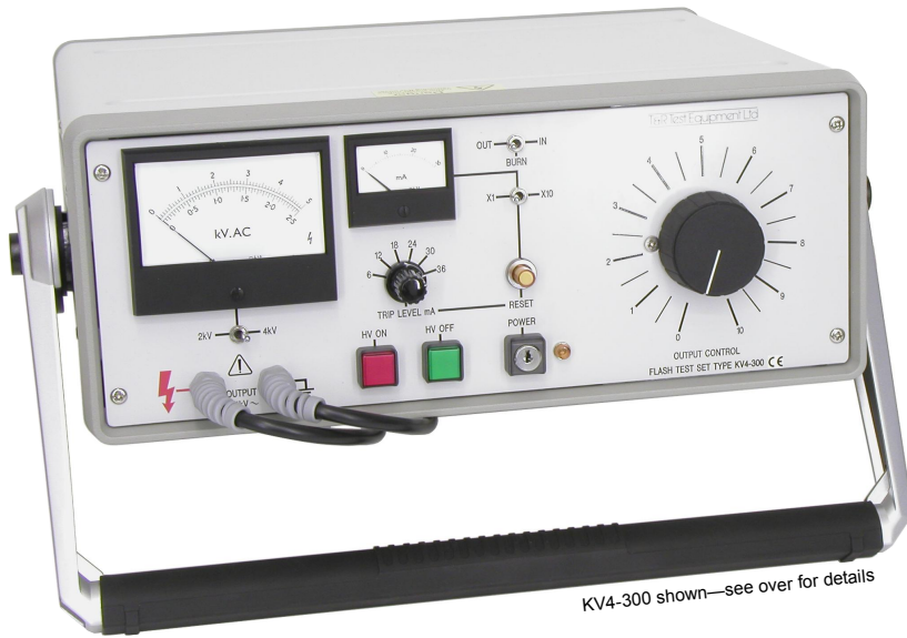
KV4-300 shown—see over for details