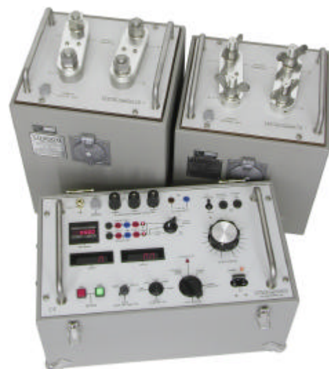
LU3000LP, LU500 and PCU1/E

The PCU1/E has a flexible timing system, allowing timing tests to be carried out to a resolution of 1ms. Selection for normally open or normally closed contacts is automatic, and the status of the contacts is shown on the front panel. Timing modes are available to test under and over current devices, re-closers, under and over voltage devices, and many current trips and circuit breakers.