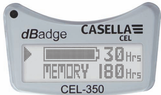
'Fuel gauge' display for memory and battery information

In addition to noise exposure parameters, the time history of the noise is logged in 1 minute values of both the average noise level and the peak value for subsequent analysis of how the noise exposure has occurred. This data can be viewed and analysed via dB35 software.