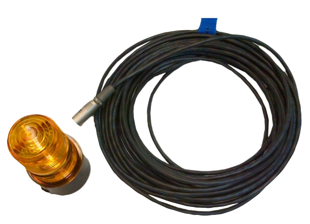
HV Strobe and Leads Cat # 1004-639 Length: 60 ft ( 18 m) Weight: 2.3 lb (1.1 kg)