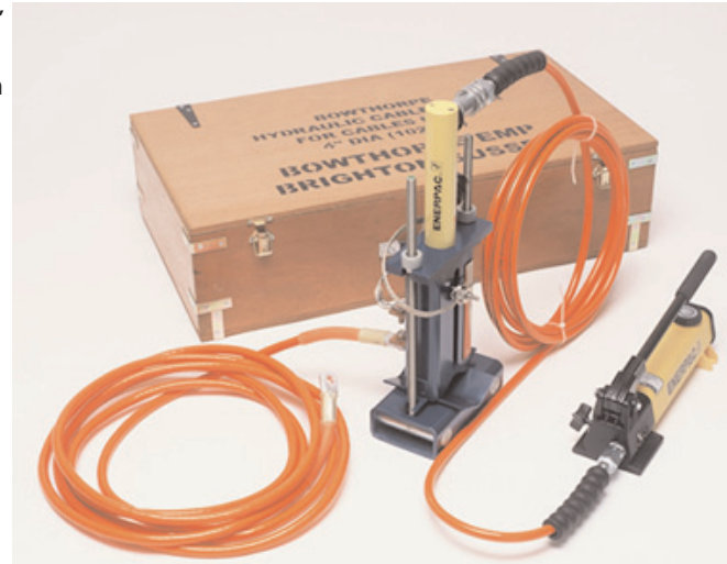
Cable Spiker Kit :- F-CSTE

All component parts are supplied in a stout wooden carrying case.