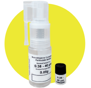
Compliance Pack ONE

The XD One Compliance Pack allows for the regular performance checking of the XD One against a supplied reference particulate range.