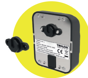
Klick Fast Stud