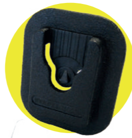
Sew On Dock