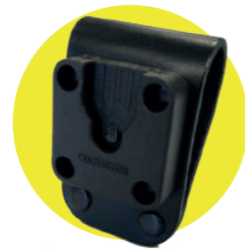
Belt Loop Dock