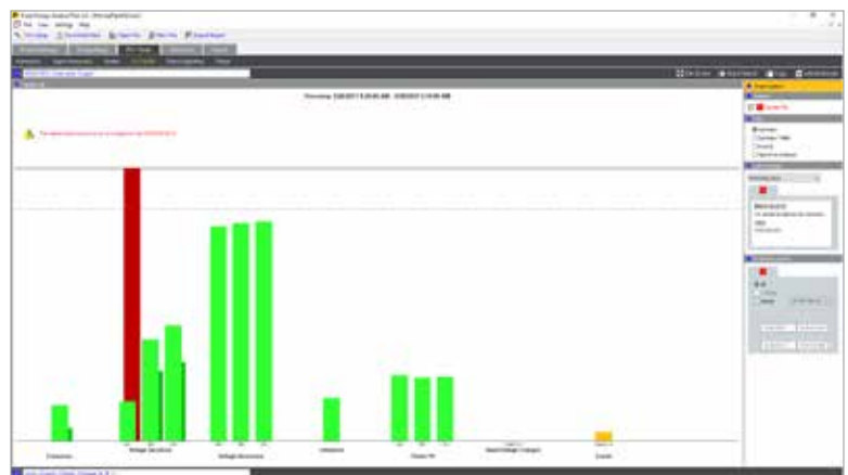
Fluke Energy Analyze Plus: Power quality health summary