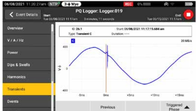
View real-time voltage transitory events while logging for faster troubleshooting

Transients negatively impact otherwise healthy systems every day and their potential to damage your equipment can't be underestimated. Whether your system is experiencing impulsive or oscillatory transients, the results can be devastating and cause problems ranging from insulation failures to total equipment failures. The Fluke 1775 and Fluke 1777 incorporate advanced transient capture technology to help you clearly identify high-speed voltage transients, so you have the data you need to stop them in their tracks. The Fluke 1775 Power Quality Analyzer has 1MHz sampling capability to capture fast transients, while the Fluke 1777 Power Quality Analyzer has 20MHz sampling capability to capture the fastest transients in high detail.