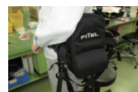
⑥ -2 Working Belt in Action