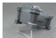
⑤ Angled Stand in Action