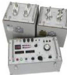
PCU1/E, LU500 and LU3000

Where higher currents and powers are required for primary injection, 7kVA and 20kVA primary injection systems are available. The PCU1/E and PCU2/E systems have separate control and loading units, allowing a wide range of load conditions to be covered with different loading units.