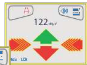
A-frame Mode Screen