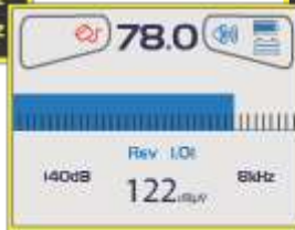
Remote Antenna Mode Screen