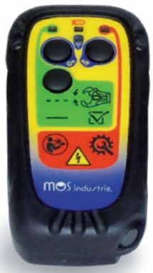
Functional and easy to use remote control Range: up to 150 m