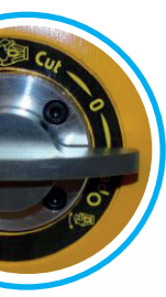
Dual effect hydraulic selector